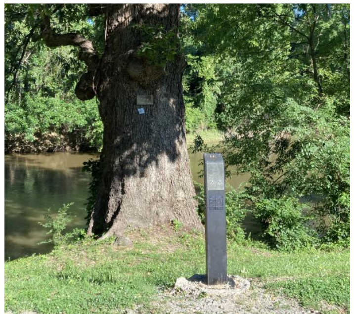
Bottom Right: Interactive public information box.