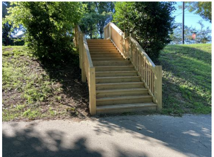
Top Right: New Steps and fencing