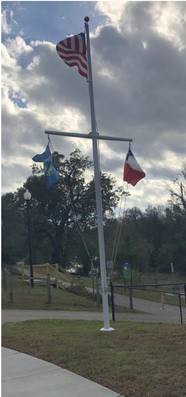
Top: Flag Pole, to be lighted