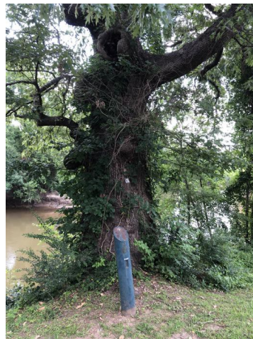
Before Images (Left)