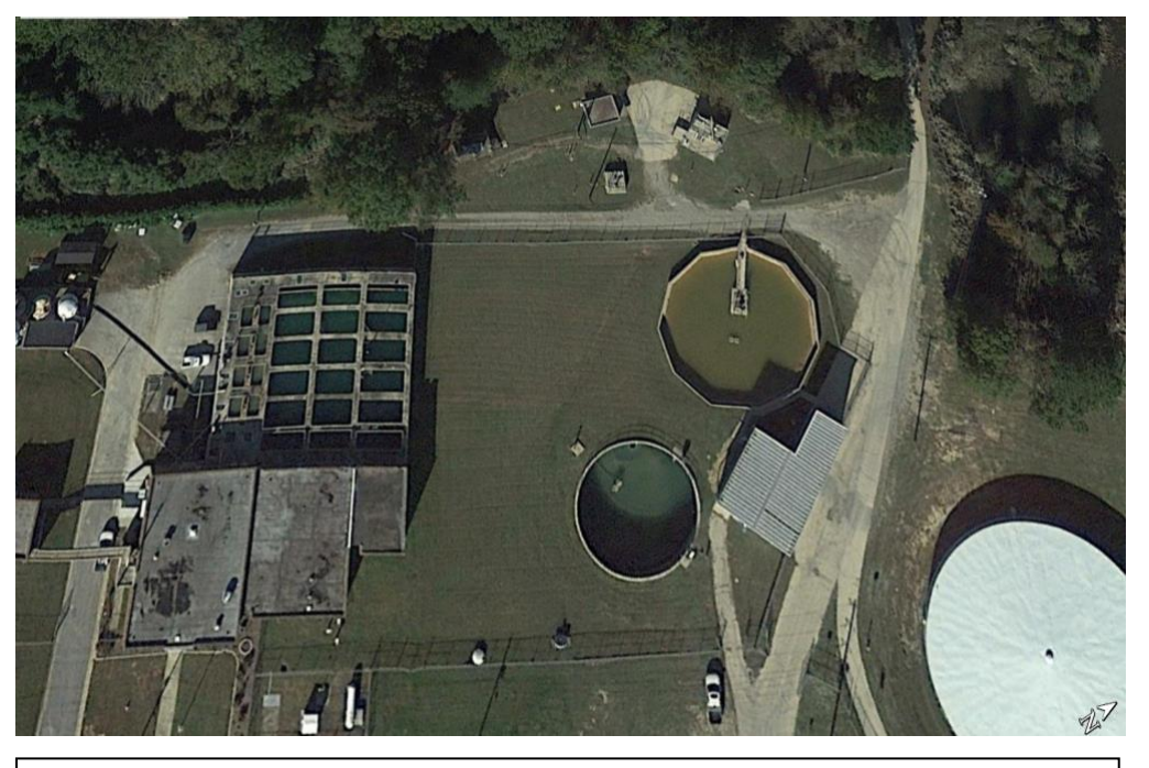
Smithfield's Water Filtration Plant is located at 515 North 2nd Street.

Our plant currently has the capacity to produce 6.2 million gallons per day with plans to expand production to 8.2 million gallons per day.