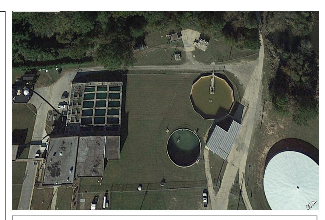
Smithfield's Water Filtration Plant is located at 515 North 2<sup>nd</sup> Street.

Our plant currently has the capacity to produce 6.2 million gallons per day with plans to expand production to 8.2 million gallons per day.