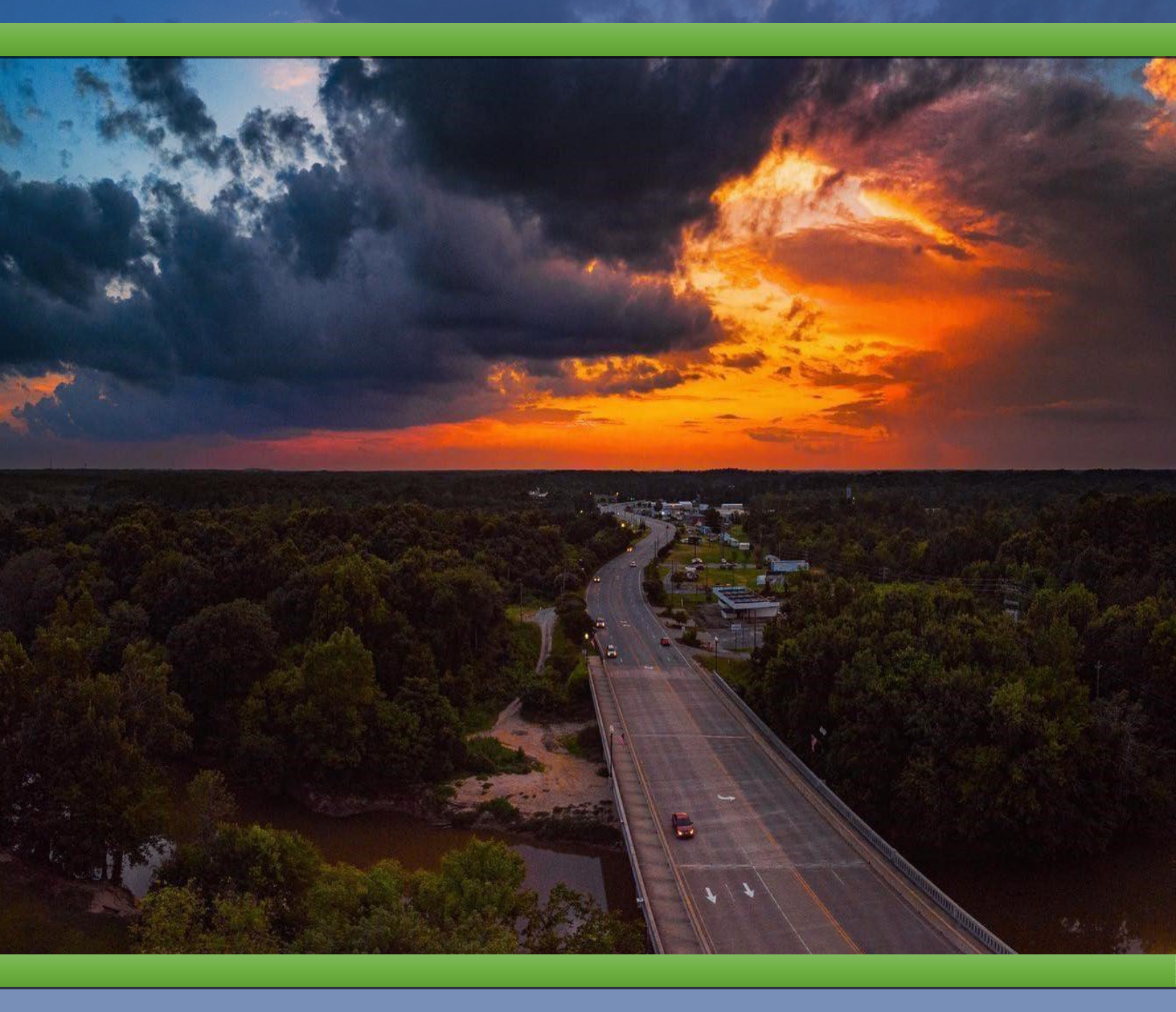
2021 – 2022 Report